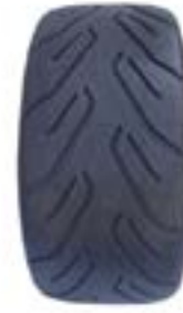
GLOB DRIFT GR2