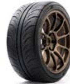
ZESTINO 07A UHP