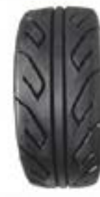
GLOB DRIFT GR3