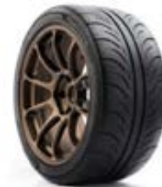
ZESTINO 7A MAX